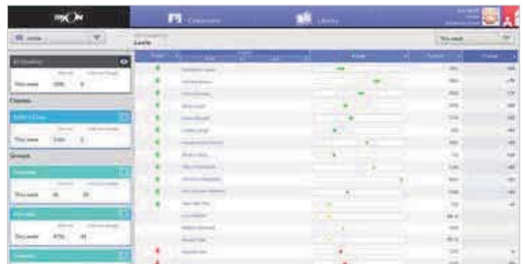
Sample Lexile Report

Real-time report functionality enables you to monitor student activity (books browsed and read, time spent reading, progress on assigned projects) as well as growth (results of embedded Lexile® assessments and optional end-of-book comprehension quizzes) and more.